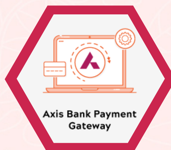
Axis Bank Payment Gateway