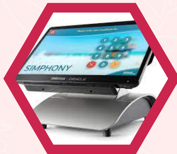
Oracle Micro Symphony Iiko POS